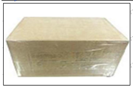
Pic No. 2 Domestic express packaging: Wrapped with Transparent tape